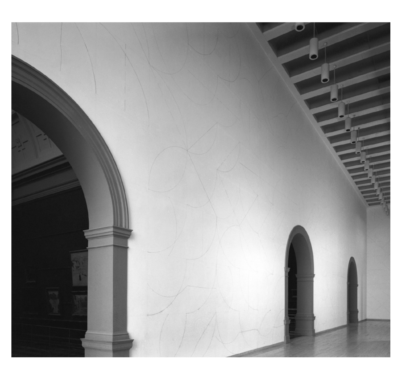
Photo: Kerry Dundas. Courtesy the Art Gallery of New South Wales © Sol LeWitt, licensed by Viscopy Australia

All two part combinations of arcs from four corners, arcs from four sides, straight, not-straight & broken lines in four directions. Installed at the Art Gallery of NSW in 1977