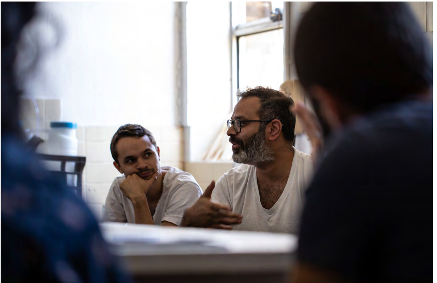
[Below]: Kaldor Public Art Project 34: Asad Raza, Absorption , 2019. The Clothing Store, Carriageworks.