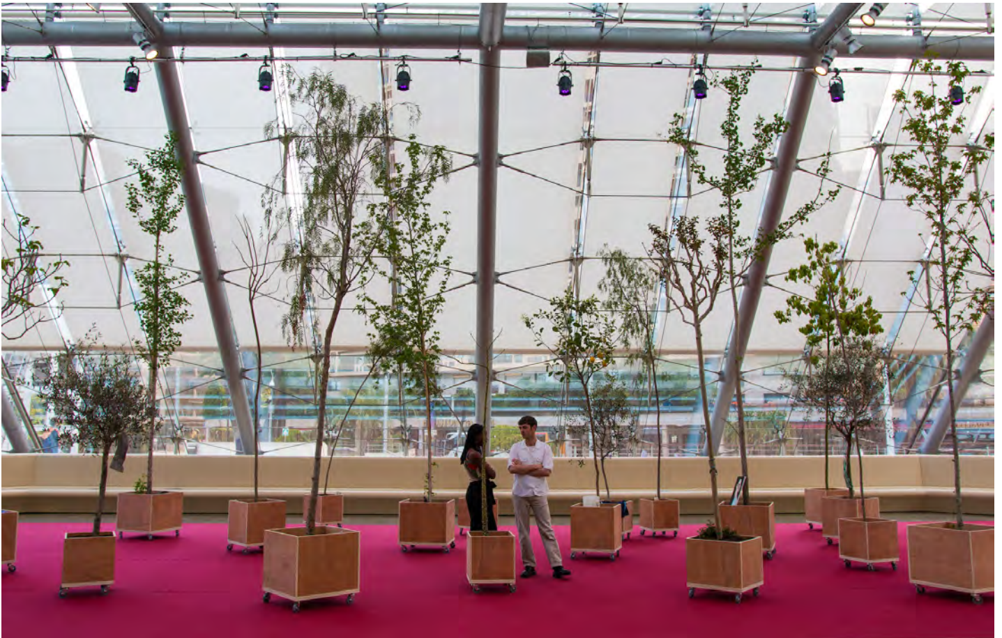
[Above]: Asad Raza, Root sequence. Mother tongue , 2017, artmonte-carlo, Monte Carlo, 2018.