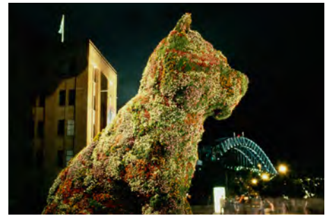
[Above]: Puppy. Project 10: Jeff Koons, Puppy , 1995, Museum of Contemporary Art, Sydney.