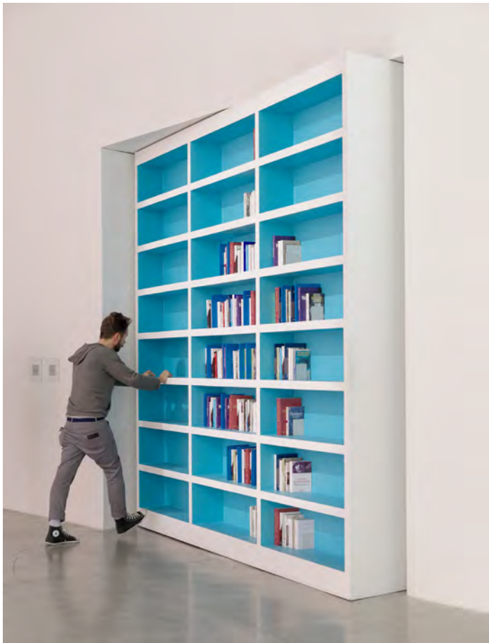
[Above]: Exhibition view, Philippe Parreno, Anywhere, Anywhere, Out of the World , Palais de Tokyo, 2013. Dominique Gonzalez-Foerster, La Bibliothèque clandestine , 2013.