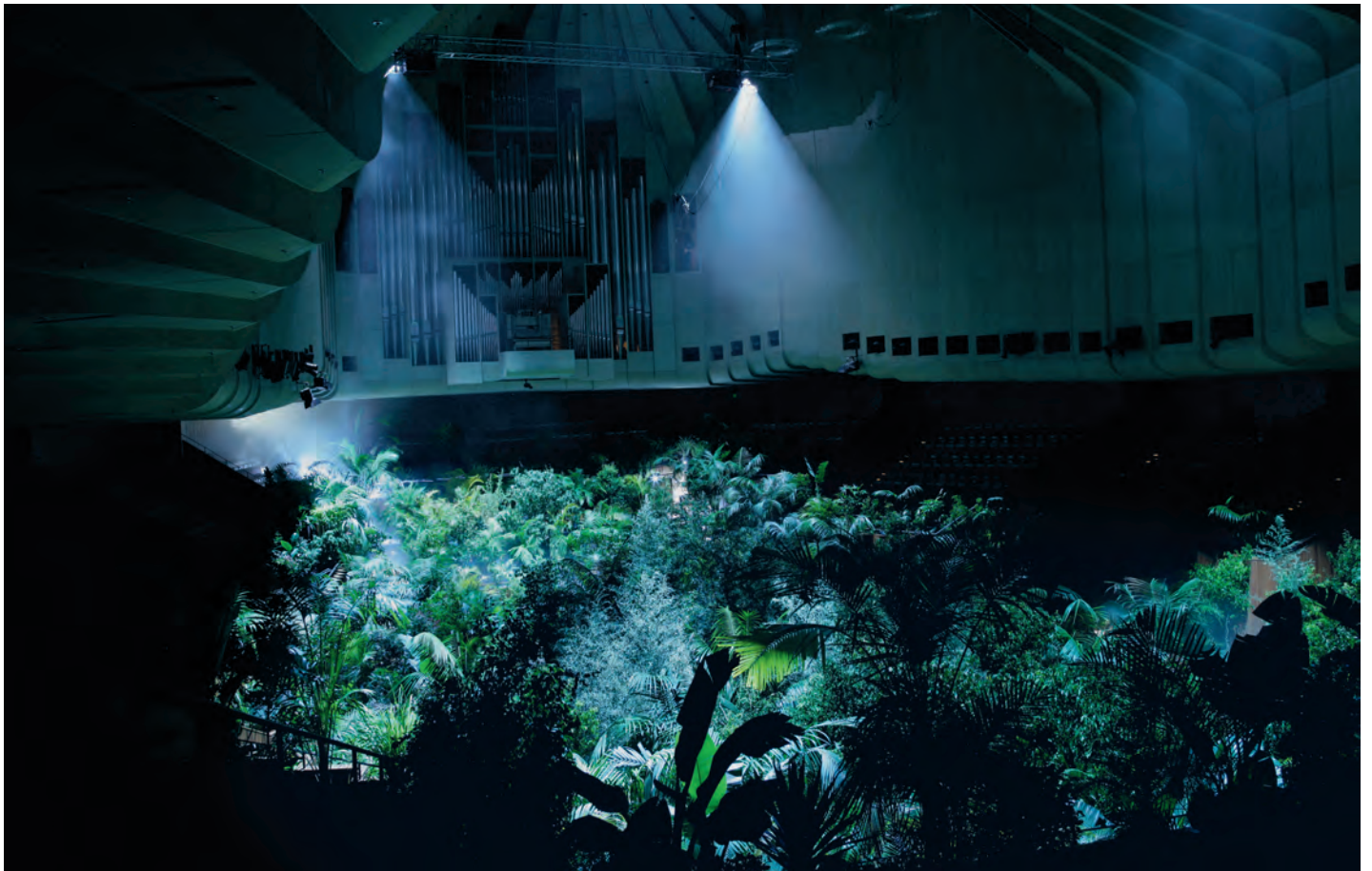
[Above]: Pierre Huyghe, A Forest of Lines , 2008, at Sydney Opera House, 16 th Biennale of Sydney (18 June 2008–7 September 2008).

Pierre Huyghe (born 1962 in Paris, France)