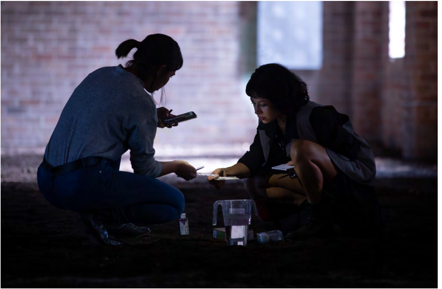
[Above]: Kaldor Public Art Project 34: Asad Raza, Absorption , 2019. The Clothing Store, Carriageworks.