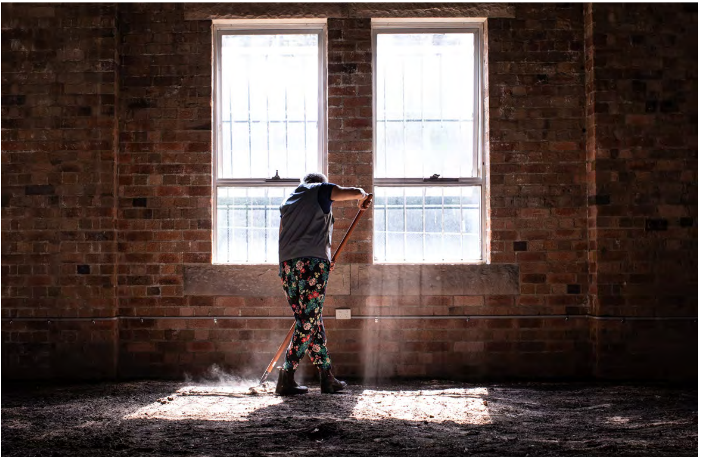
[Below]: Kaldor Public Art Project 34: Asad Raza, Absorption , 2019. The Clothing Store, Carriageworks.