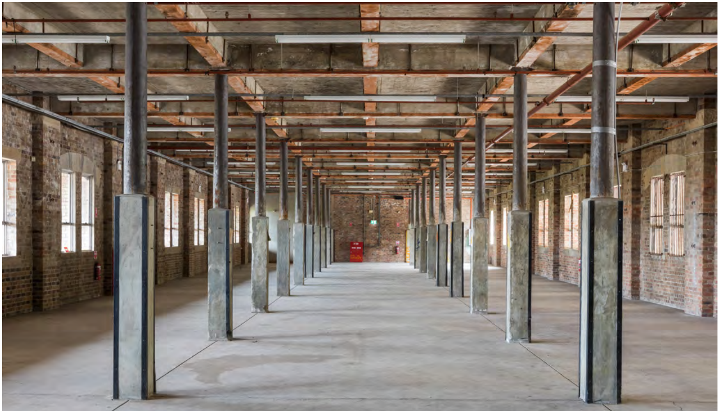
[Above]: The Clothing Store, Carriageworks, Sydney, 2017.

The Clothing Store building is located on Gadigal Land in the Eora nation, in what we now know as the inner Sydney area of Redfern/Eveleigh. It was built in 1913 as part of the Eveleigh Railway Workshops, and was originally used to produce, store and dispatch uniforms for the thousands of railway workers who were employed on the site.