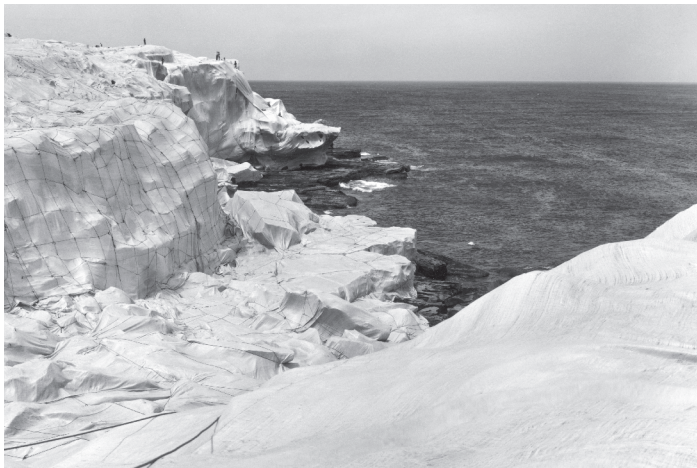
[Above]: Project 1: Christo and Jeanne-Claude, Wrapped Coast – One Million Square Feet, 1968–69, Little Bay, Sydney.

For half a century, we have worked with some of the world's most esteemed and iconic international artists, including Gilbert & George, Charlotte Moorman & Nam June Paik, Sol LeWitt, Richard Long, Ugo Rondinone, Gregor Schneider, Bill Viola, Urs Fischer, Michael Landy, Thomas Demand, Roman Ondák, Tino Sehgal and Marina Abramović, amongst others. Our temporary projects have had a lasting impact on the cultural landscape and have changed the way the Australian public sees and experiences the art of today.