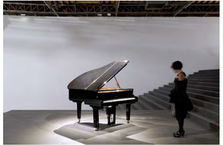
[Above]: Exhibition view, Philippe Parreno, Anywhere, Anywhere, Out of the World, Palais de Tokyo, 2013. Liam Gillick, Factories in the snow, 2007.

In his exhibition Anywhere, Anywhere Out of the World (2013-14), presented at the Palais de Tokyo, Paris, Philippe Parreno encouraged visitors to embark on an art adventure, in which they moved through rooms by pushing on a rotating bookcase, while automated pianos played Petrushka by Igor Stravinsky. As the exhibition changed and evolved over time, viewers were required to demonstrate an extraordinary level of patience and curiosity in order to experience its full potential.