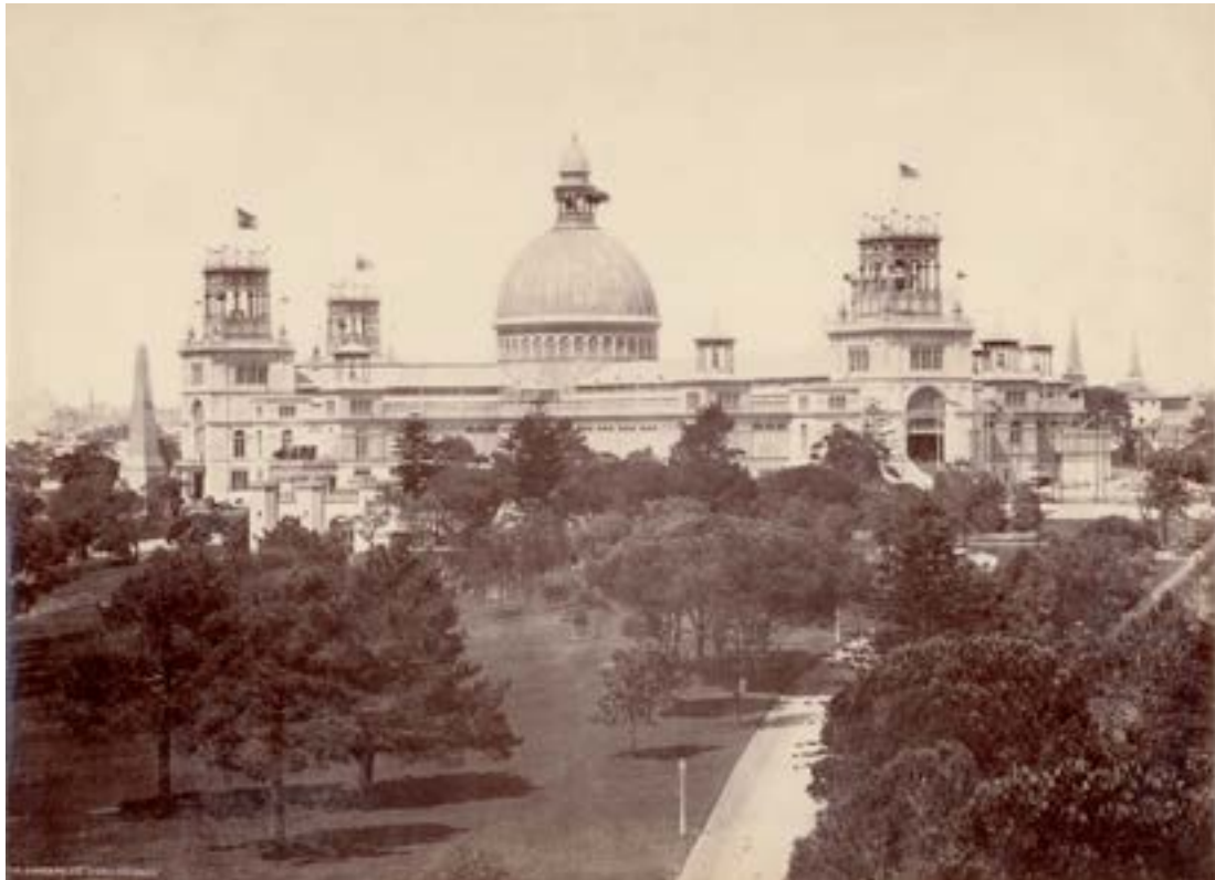
The Garden Palace, Sydney, 1880

The exhibition was intended as a major public event and over a million visitors flocked through the turnstiles 9 – an extraordinary number given that the city's population at the time was about 80,000. 10 A highlight of the visit was Sydney's first hydraulic passenger lift, taking passengers to an observation deck that offered spectacular aerial views of the city. Strolling the exhibition halls, visitors could marvel at the vast array of raw materials, such as wool, wheat, coal and gold, along with the latest in technological innovations of the Australian colonies. Displays of imported art and luxury goods encouraged the growing colonial middle class to cultivate their tastes.