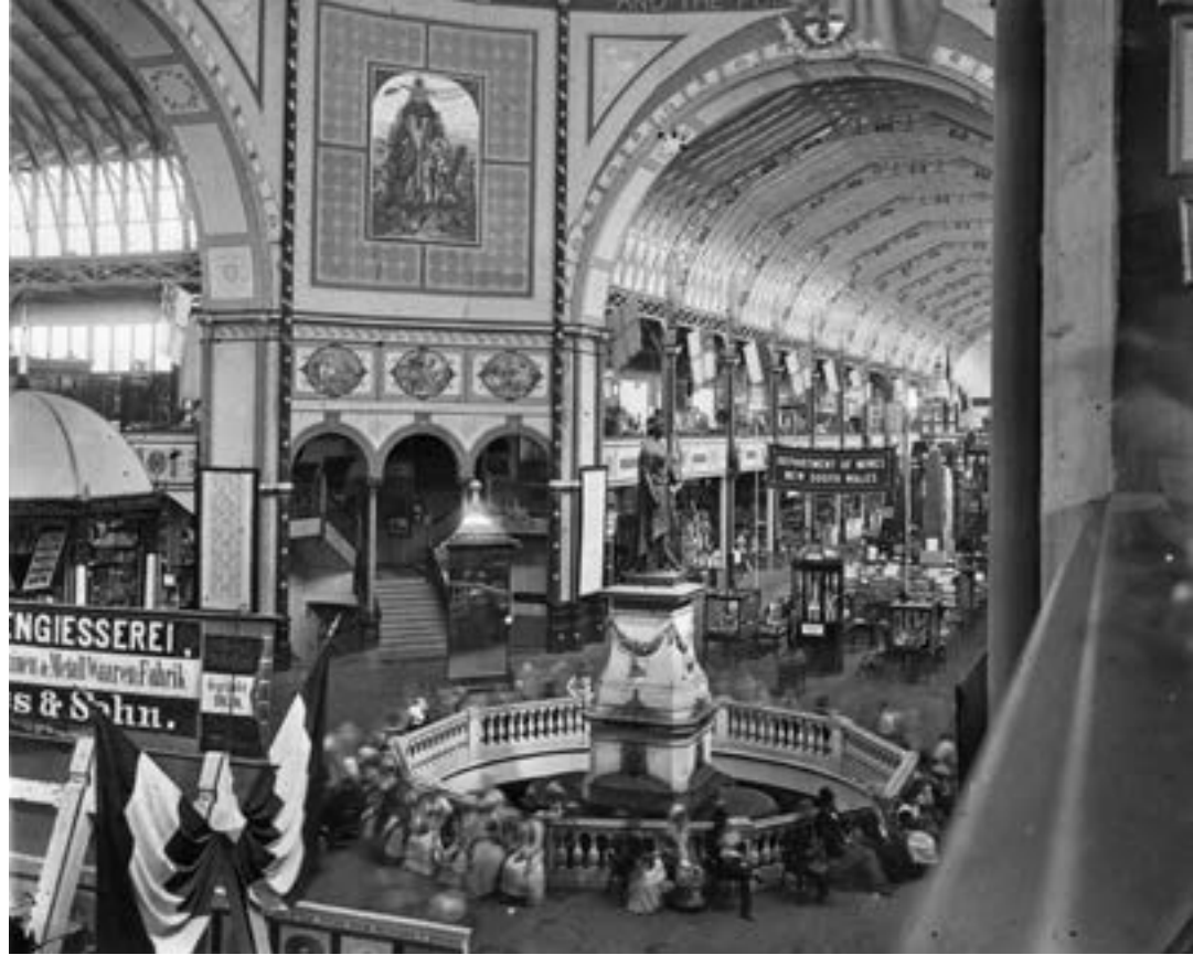
The Sydney International Exhibition at the Garden Palace, 1879–80, photograph

In stark contrast, an upstairs gallery known as the Ethnological Court was dedicated to Indigenous artefacts collected from across south-east Australia and the Pacific. On exhibition were men's objects, such as shields, spears, axes and boomerangs, displayed as exotic weapons and relics of a "violent" and "soon-to-be extinct" race. No reference was made to individual artists and their cultural knowledge, or to the often-violent circumstances, including theft and coercion, under which the objects were acquired from countless communities.