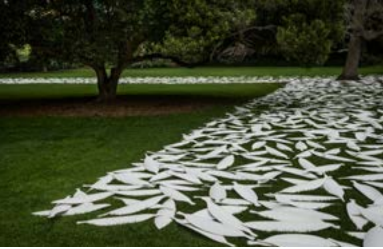
Shields from barrangal dyara (skin and bones), September 2016, Royal Botanic Garden Sydney.