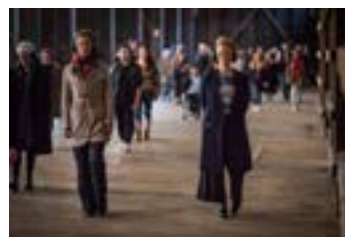
Project 30: Marina Abramovic, In Residence, 2015, Pier 2/3, Walsh Bay.