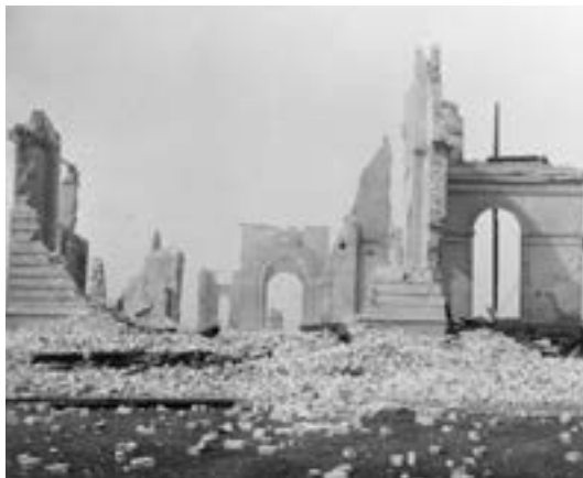
The ruins of the Garden Palace, Sydney, after the fire, 1882, detail Photograph, State Library of New South Wales, Sydney, GPO 1 – 07018

Through these colonial modes of collection and display the Sydney International Exhibition framed a narrative of modernity and progress, legitimising the expansion of the colonies and the continued dispossession of Aboriginal peoples. The British Empire was depicted as a civilising force, taming and transforming the land and launching a new era of wealth and prosperity. Aboriginal people were represented as primitive and nomadic, relics of "Australia's dark, mysterious yesterday" 11 and destined to be left behind by the inevitable march of history.