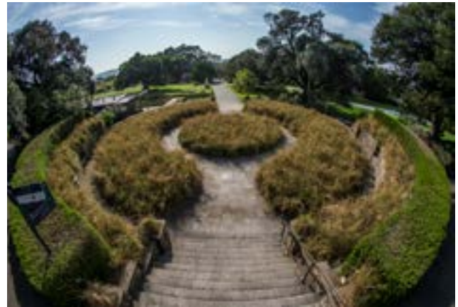
Native meadow of kangaroo grass ( Themeda triandra ), September 2016, Royal Botanic Garden Sydney.

The Narran was full of water everywhere, and with this abundance of water there was also plenty of most excellent grass ... a grass whereof the seed is made by the natives into a kind of paste or bread. Dry heaps of this grass, that had been pulled expressly for the purpose of gathering the seed, lay along our path for many miles. 19