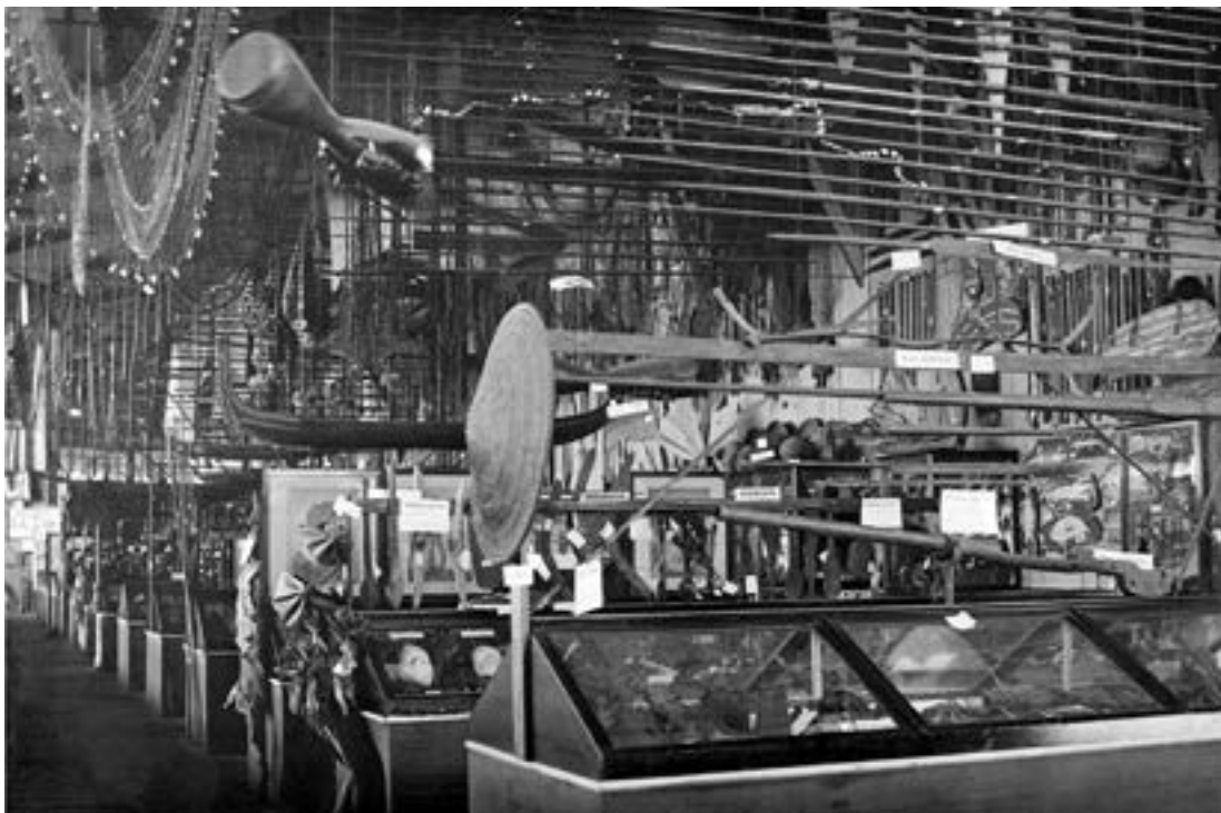
The Ethnological Court at the Garden Palace, Sydney, 1879–80, photograph, Australian Museum Archives, Sydney, AMS351/V11460