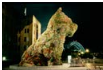
Project 10: Jeff Koons, Puppy , 1995, Museum of Contemporary Art, Sydney.